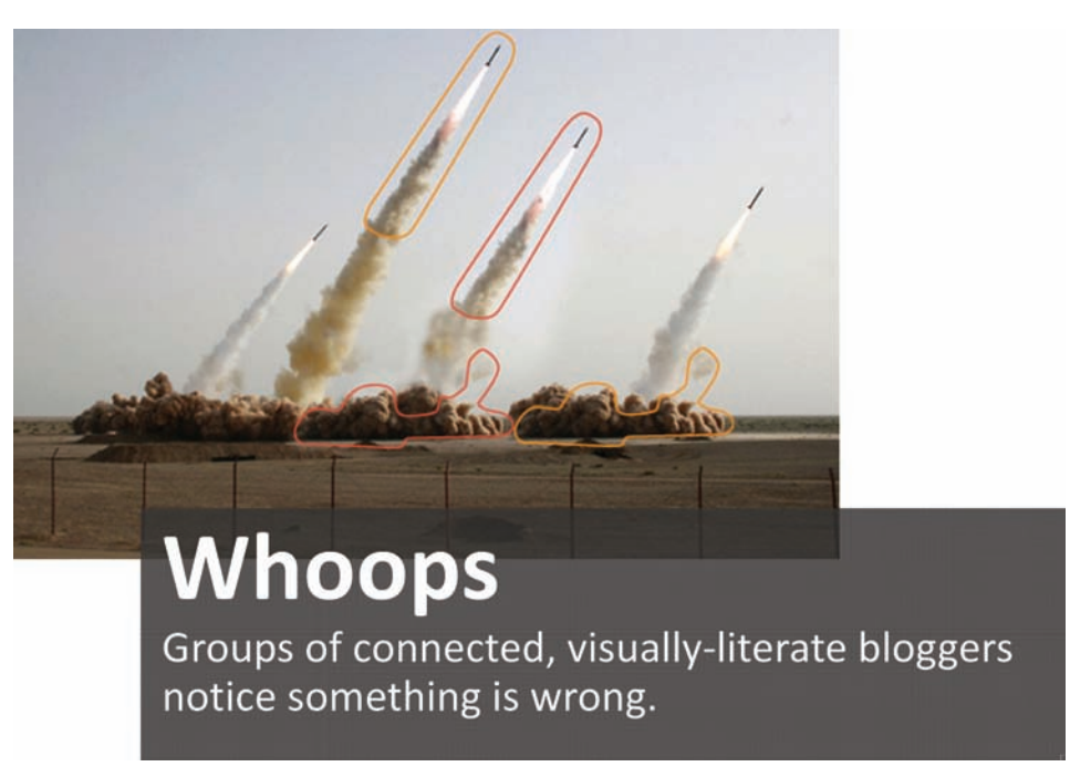
Figure. Iranian propaganda photo.

Third, the Internet has created several new forms of literacy. One is what Thompson calls "photographic literacy." Decades ago, newspaper readers believed that news photographs portrayed their subjects literally. Although other examples surely exist, Thompson pointed out that Joseph Stalin pioneered the art of manipulating photographic images, erasing offending commissars from official photographs in an attempt to revise history. In the 1980s, with the advent of Photoshop, people began to understand how easily photos can be manipulated. Photo manipulators now had a harder time tricking people. In 2008, Iran published a propaganda photo (see Figure) showing the simultaneous launch of four missiles. Newspapers around the world ran