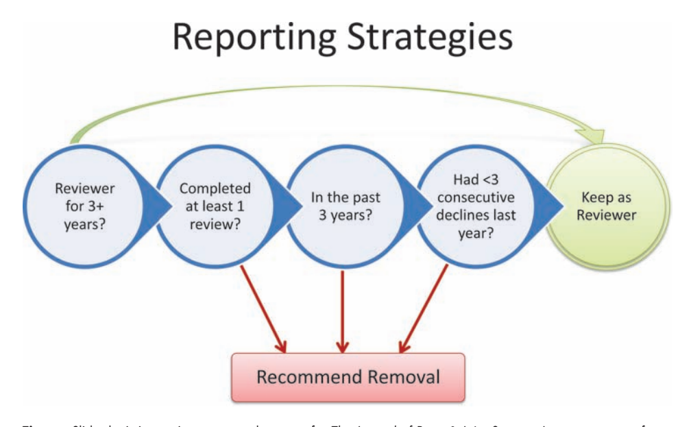
Figure. Slide depicting reviewer removal process for The Journal of Bone & Joint Surgery.

Evaluating all players on the journal side of the peer-review process—editors, reviewers, editorial board members, and staff members—can provide benchmarks that may lead to improved journal performance. But which metrics do we look at and what numbers do we crunch? This panel of experts shared their experiences and offered practical suggestions about evaluation methods they are using to maintain their competitive edge.